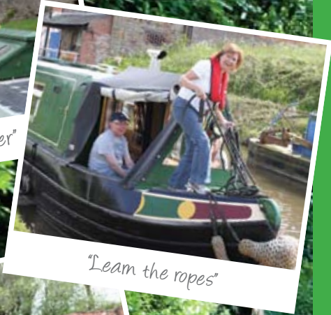
"Learn the ropes"