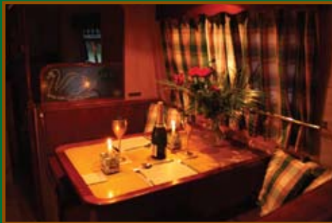
Perfect for a 'Romantic Weekend'