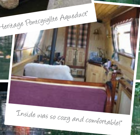
"Inside was so cozy and comfortable!"