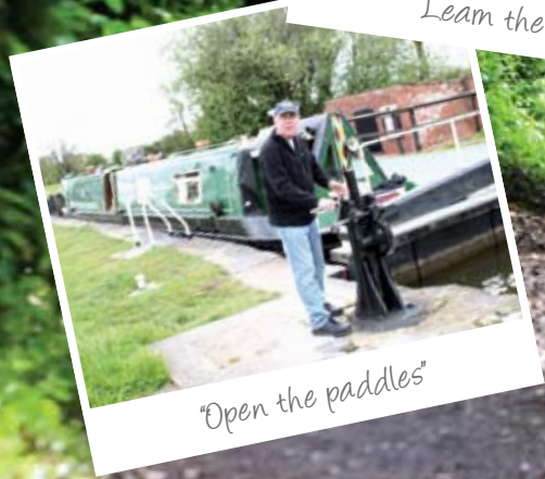
"Open the paddles"