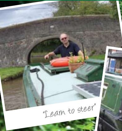
"Learn to steer"

A great way to experience a cruise before you hire or buy