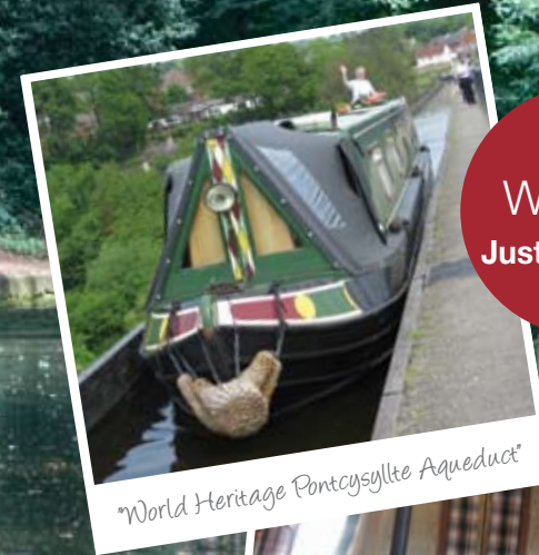
"World Heritage Pontcysyllte Aqueduct"

CHESHIRE AND THE FABULOUS LLANGOLLEN CANAL